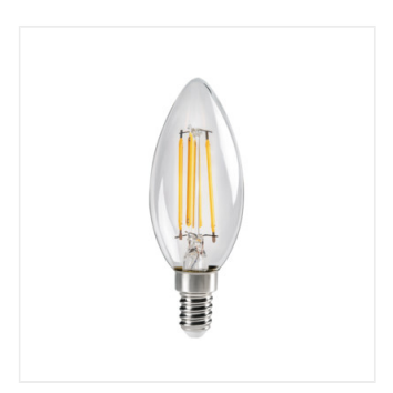
XLED C35E14 4,5W