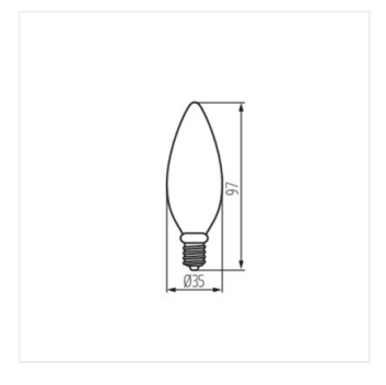
XLED C35E14 2,5W, XLED C35E14 4,5W